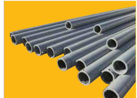
Drill Stem Assembly

Bulletin PSS-90-6.11 (E/A4) August 2012. © 2012 Flowserve Corporation