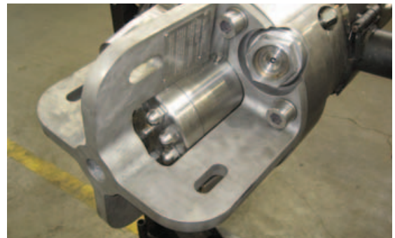
Proprietary AutoShift Decoking Tool